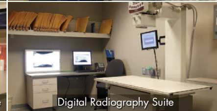
Digital Radiography Suite