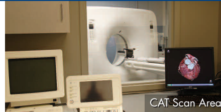
CAT Scan Area