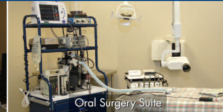
Oral Surgery Suite