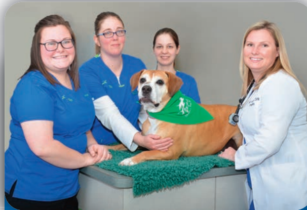
IndyVet's Blood Donation Center Team