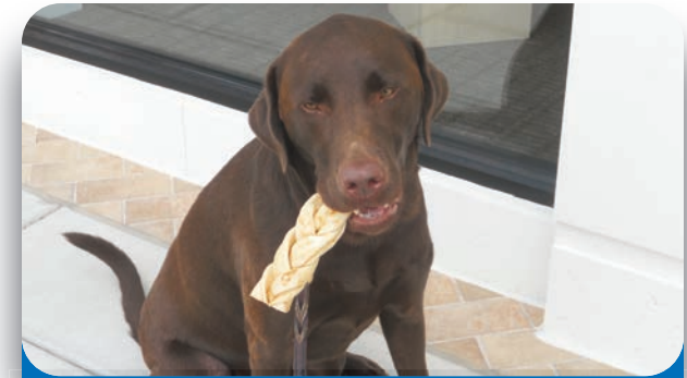
I'm A Hero, I Donated Blood!

After each six donations, donors will also receive a Blood Donor Reward Card that can be used at IndyVet for any service (emergency, internal medicine, surgery, and/or ophthalmology).