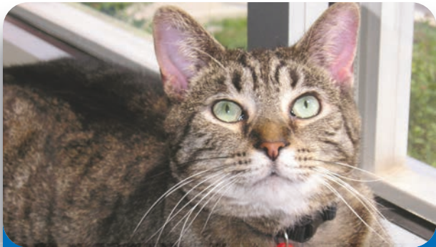
I'm A Hero, I Donated Blood!

The IndyVet donor program benefits thousands of pets that receive blood transfusions every year as well as the donors themselves! IndyVet partners with local veterinarians to assist in caring for our blood donors for their service.